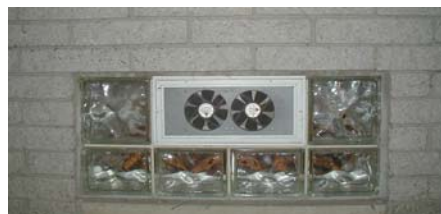
Outside view of installed Vent-Maxx

Manufactured by: BOLD Technologies, Inc. 2873 Daley Drive, Troy, MI 48083 Phone: 248-457-2000 x14 Email: sales@vent-maxx.com Website: www.vent-maxx.com