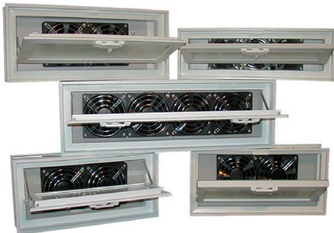
Vent-Maxx unit Installed In several common vent sizes.

These fans are great for moving smoke, pet odors, musty smells, whatever.... right out of your house. Easy to install or moved to any window vent using only a screwdriver. Ultra thin design allows vent to be closed and locked while fan is installed and can be operated year round.